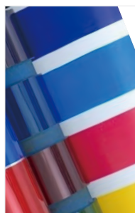
Ink & Printing

It is widely used in ink, printing, film processing, textile dyeing, plastic electronics and other industries for accurate color measurement and quality control, as well as in scientific research institutions, quality testing institutions, laboratories; especially suitable for precise measurement and quality control of optical density and dot enlargement in ink printing.